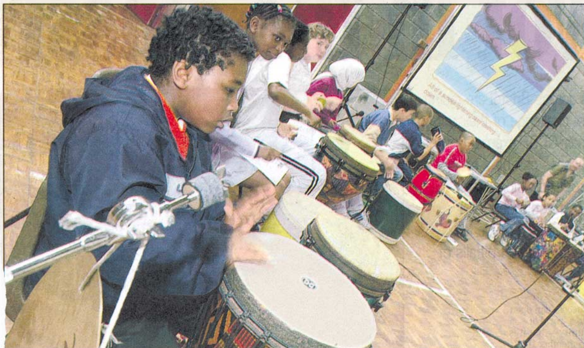
On the beat: Pupils at Easton Primary School give a concert after attending the workshops